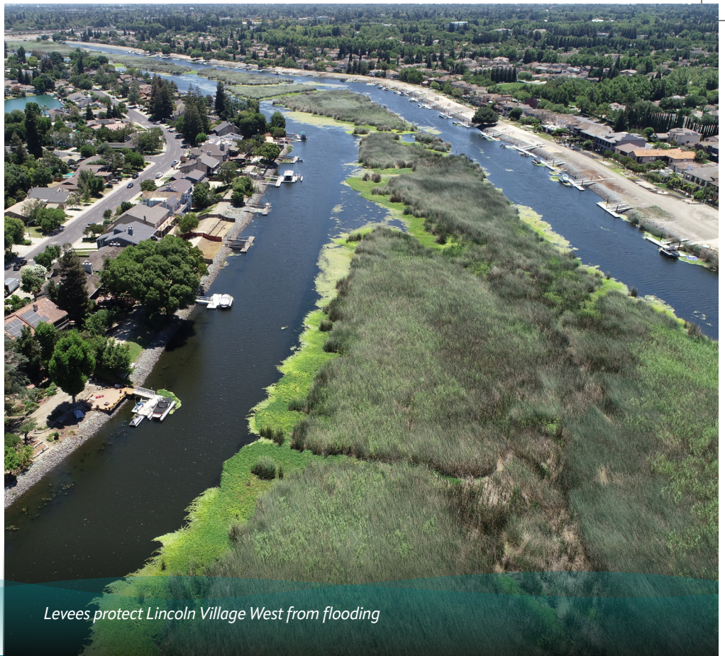
Levees protect Lincoln Village West from flooding