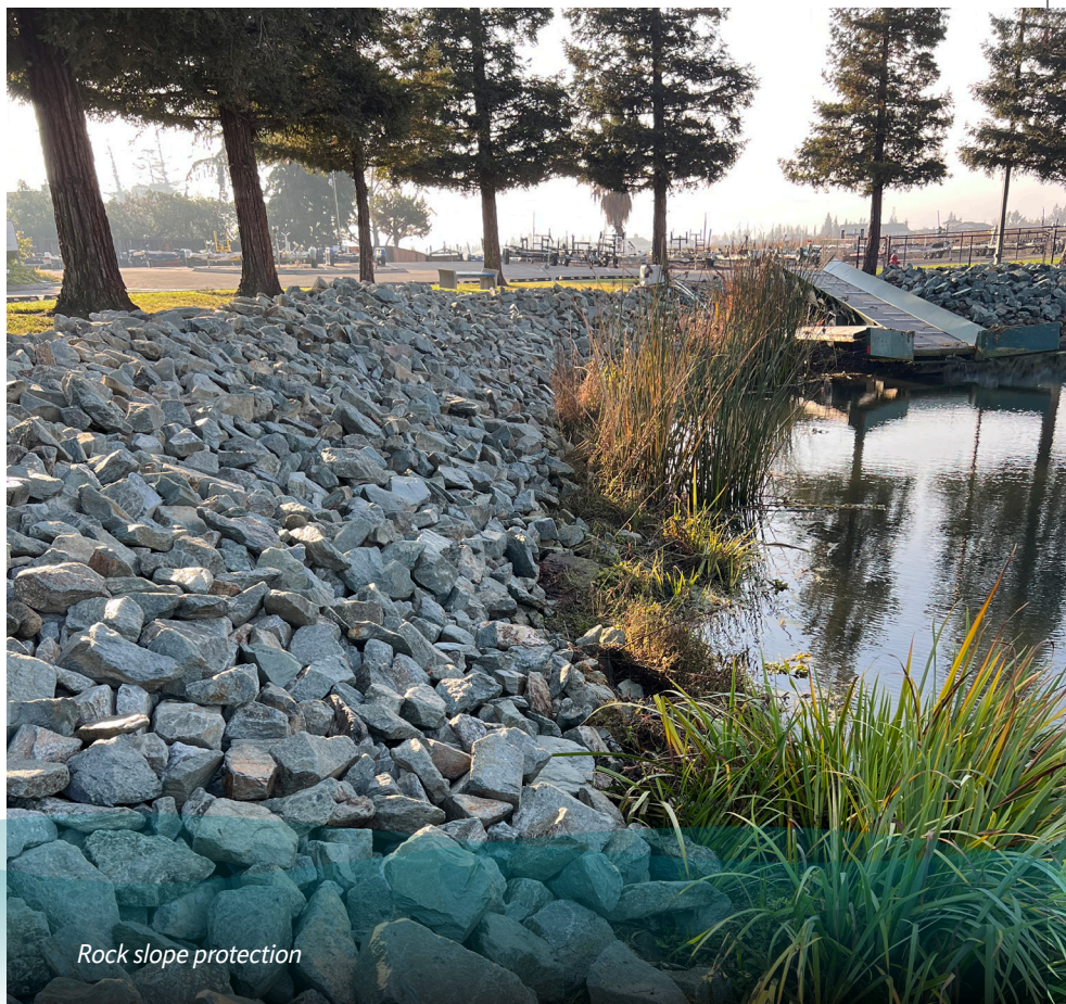
Rock slope protection

ONE OF RD 1608'S PRIORITIES is ensuring levees are armored with riprap (quarry stone) on the waterside slope of levees to prevent erosion from tides, high water, waves and rain. Recently, RD 1608 completed a rock slope protection maintenance project along the levee adjacent to Village West Marina [see photo]. The project anticipates receiving partial reimbursement of costs through the Delta Levees Subvention Program administered by the CA Department of Water Resources. RD 1608 continues to seek state funding to reduce flood risk and keep costs for maintenance as low as possible.