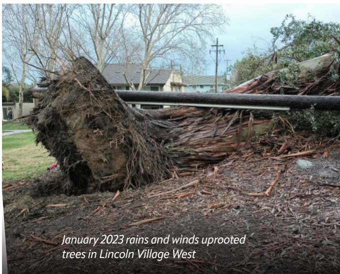
January 2023 rains and winds uprooted trees in Lincoln Village West