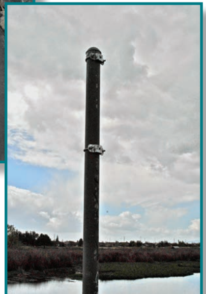
A sign post with the sign removed.