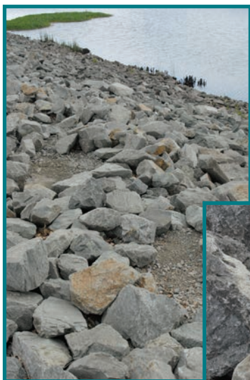
Missing rocks on the levee

Thieves are stealing the rocks on the levee or throwing them into the water. Not just small rocks are being tossed. Remember: all the rocks are needed to protect the levee from erosion. Dirt areas without rocks increase the risk of levee damage. And, the cost of the rocks adds up for the property owners in our District.