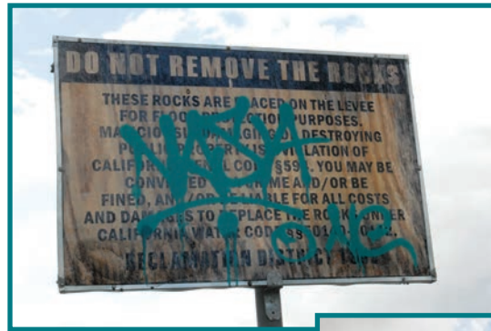
Tagging of signs and roads in the District